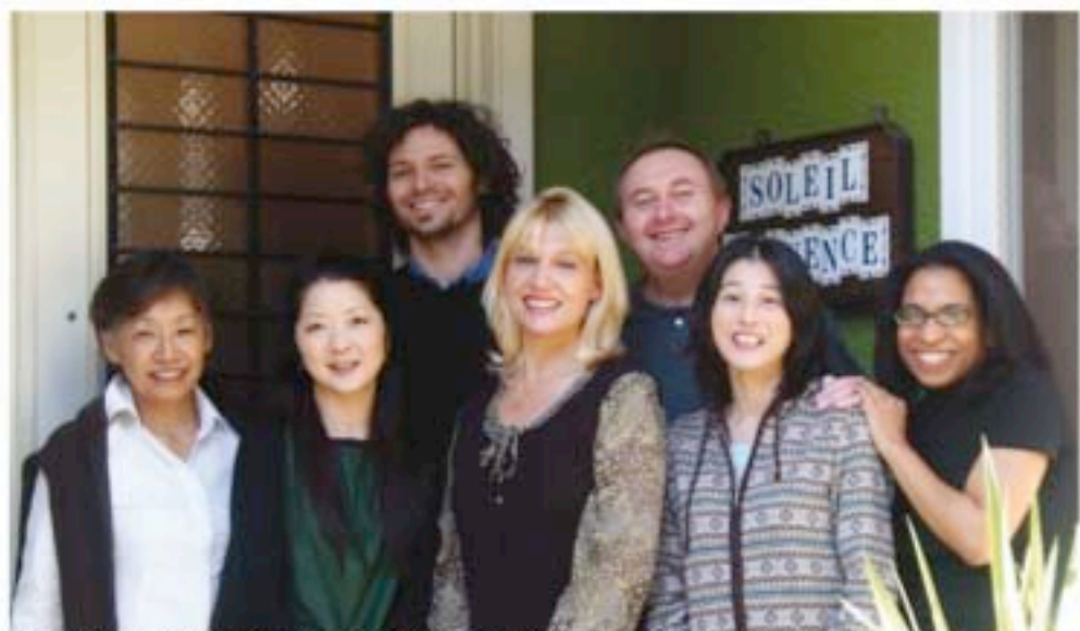
The Bonzi's with some of their staff and students at their home and school, Soleil Provence.